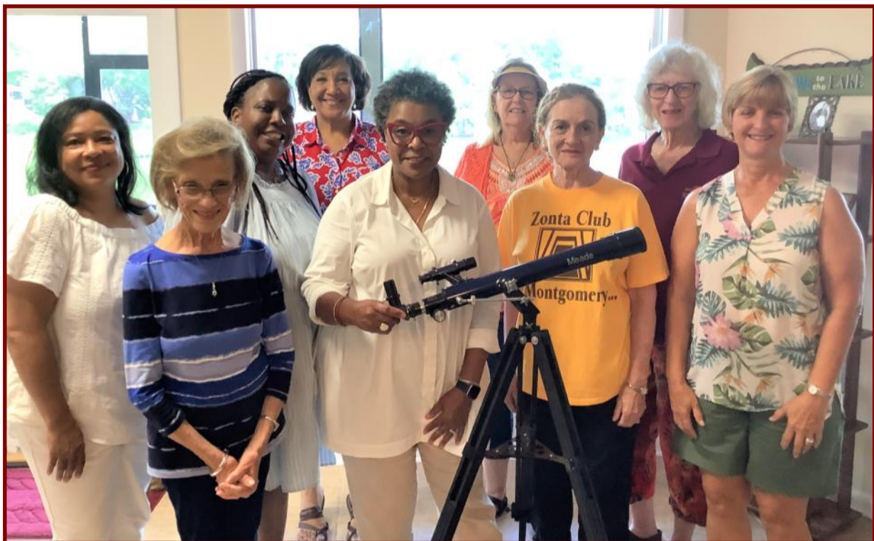
Zonta Club of Montgomery, AL ( zontamontgomeryal.org )